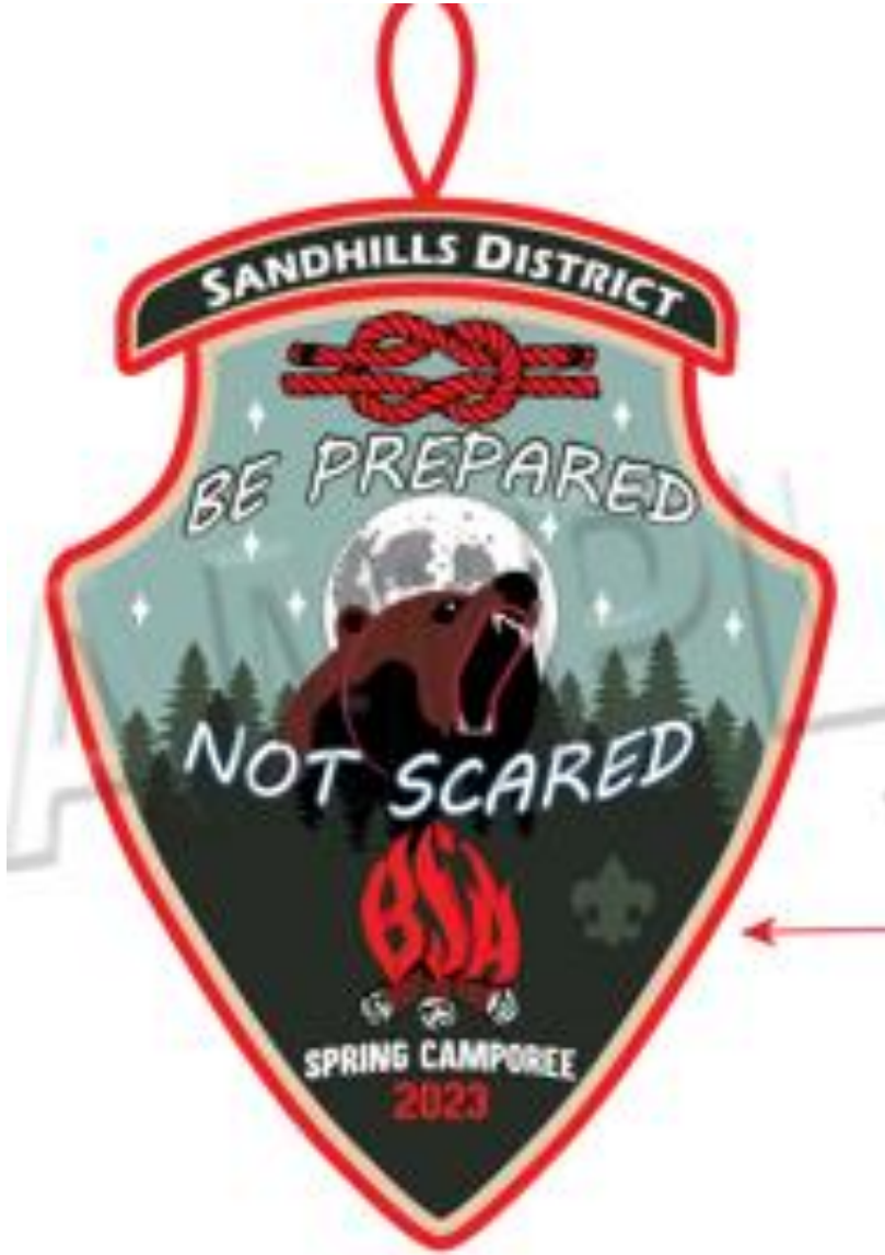
Camporee patch (Not Actual Size)